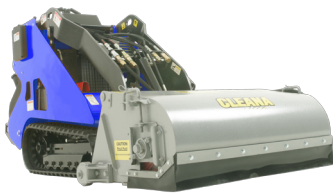
mini broom also available