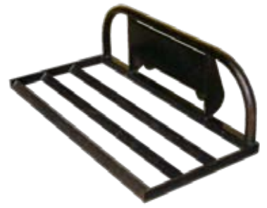
Mini Carryall Leveller also available