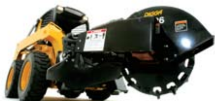
Stump Grinder also available