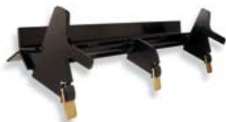
Kwik Rips also available