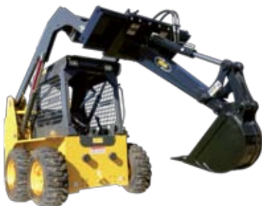
Skid Hoe also available