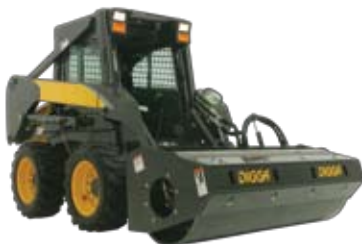
Vibratory Roller also available