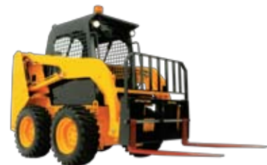
Pallet Forks also available

GET ATTACHED with an experienced partner