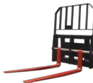
Mini Pallet Forks also available

Skid Steer Loaders, Front End Loaders and Telehandlers