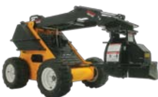
Mini Stump Grinder also available